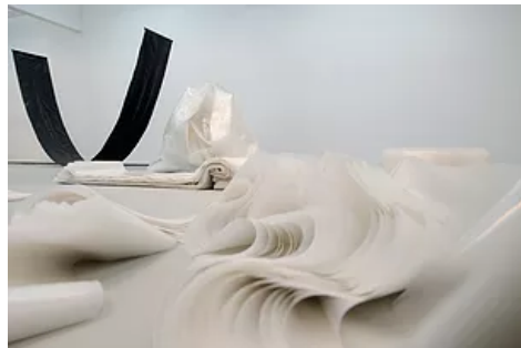
MIGUEL BRACELI 1:1. Solo Show. Caracas, Venezuela. 2018