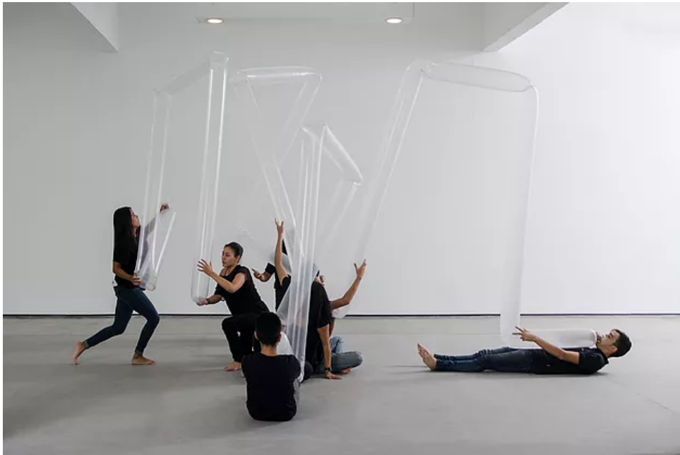
"HABITAR EL AIRE DEL CUERPO". Educational project FAU UCV. 2018.