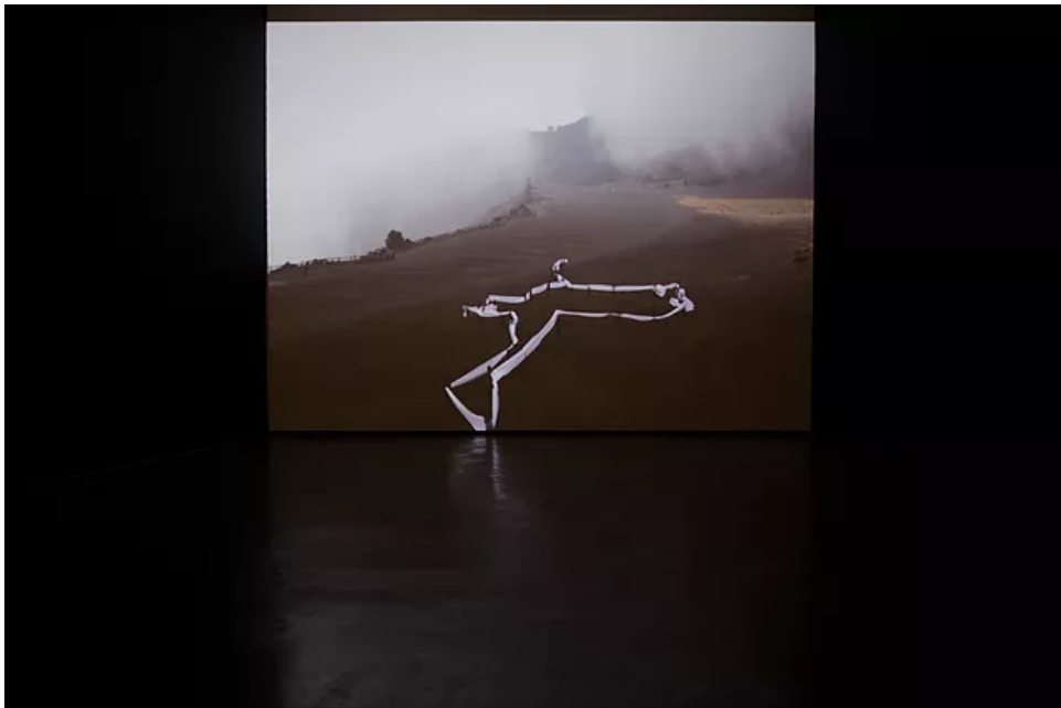
Video Installation. IRAZÚ. Irazú Volcano, Costa Rica. 2016